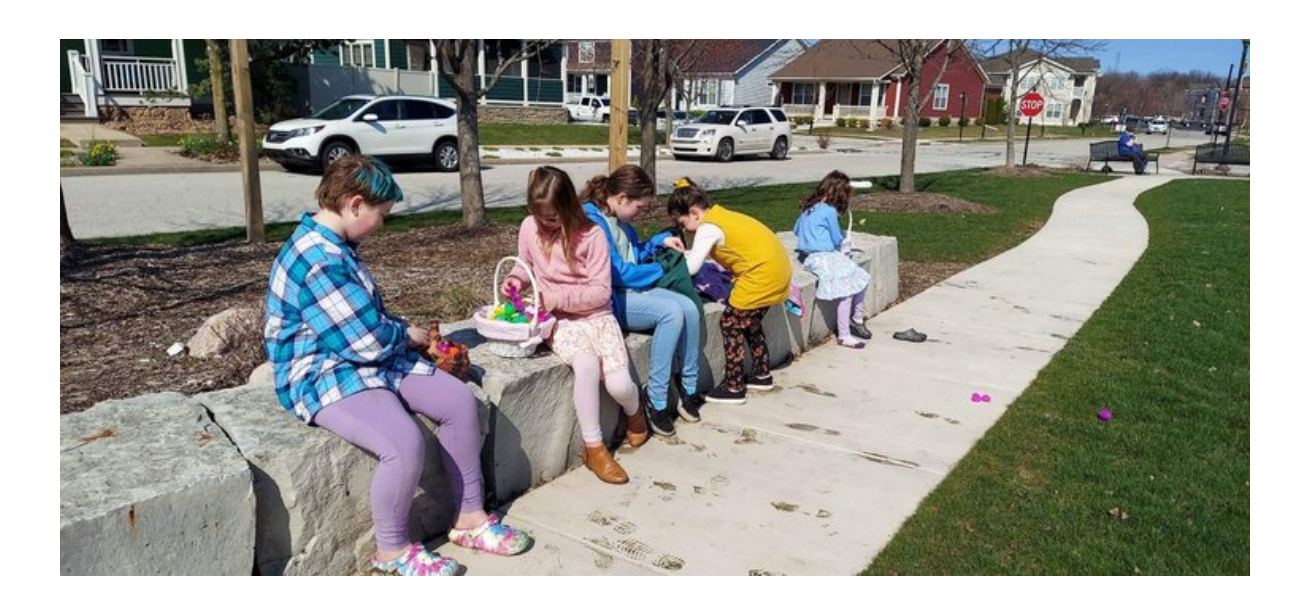
Examining the Easter Egg Hunt Haul