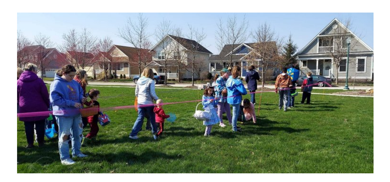
Time for the Hunt