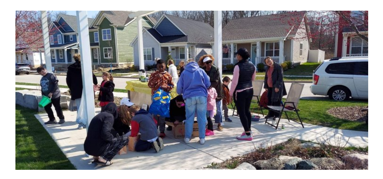
After the Hunt Snacks