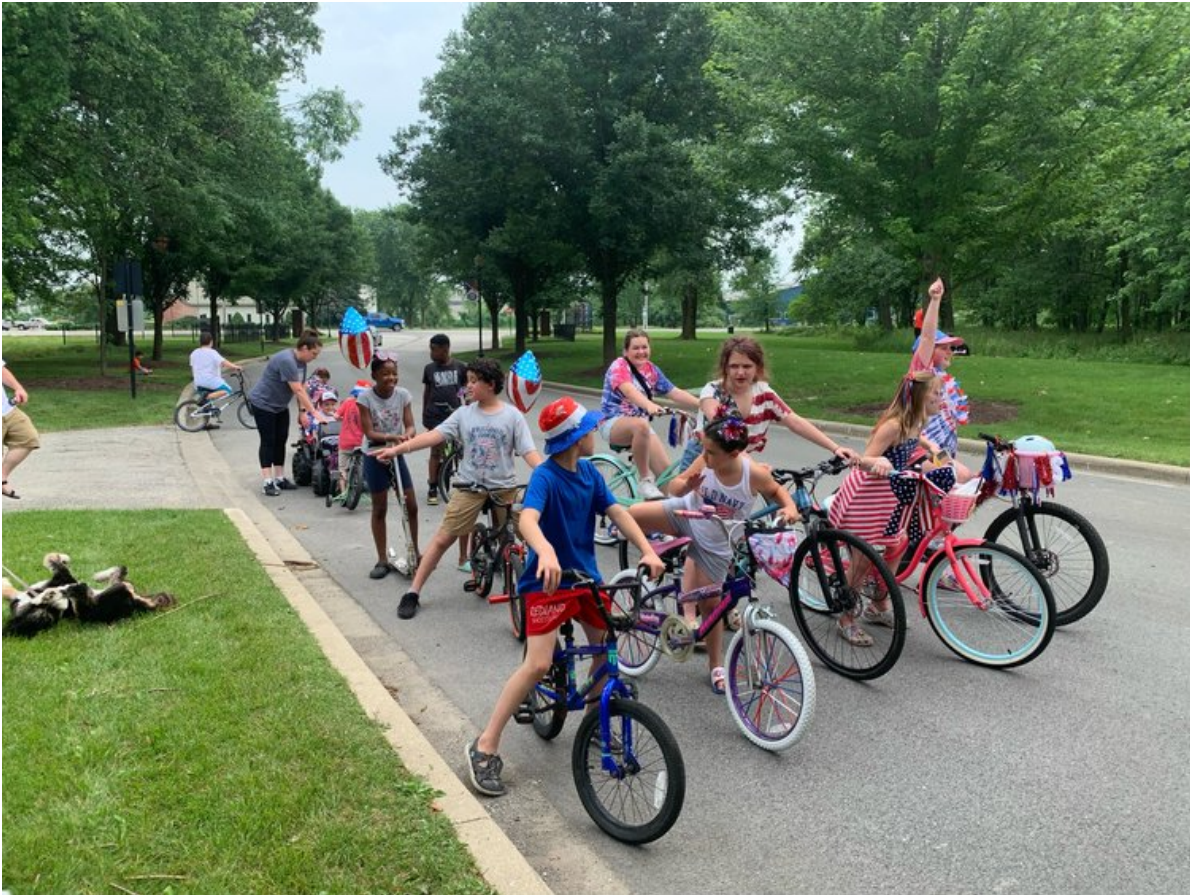
4th of July Parade Lineup

We are still looking for a family to host the last movie night this season on 8/19. The family that hosts movie night gets to pick the movie. Parents remember to get boxes for your children to attend the Drive-In Movie Night on Saturday, July 22.