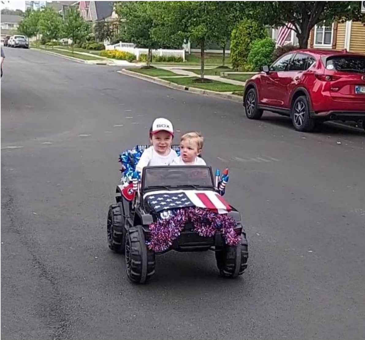
4th Festive Power Wheels