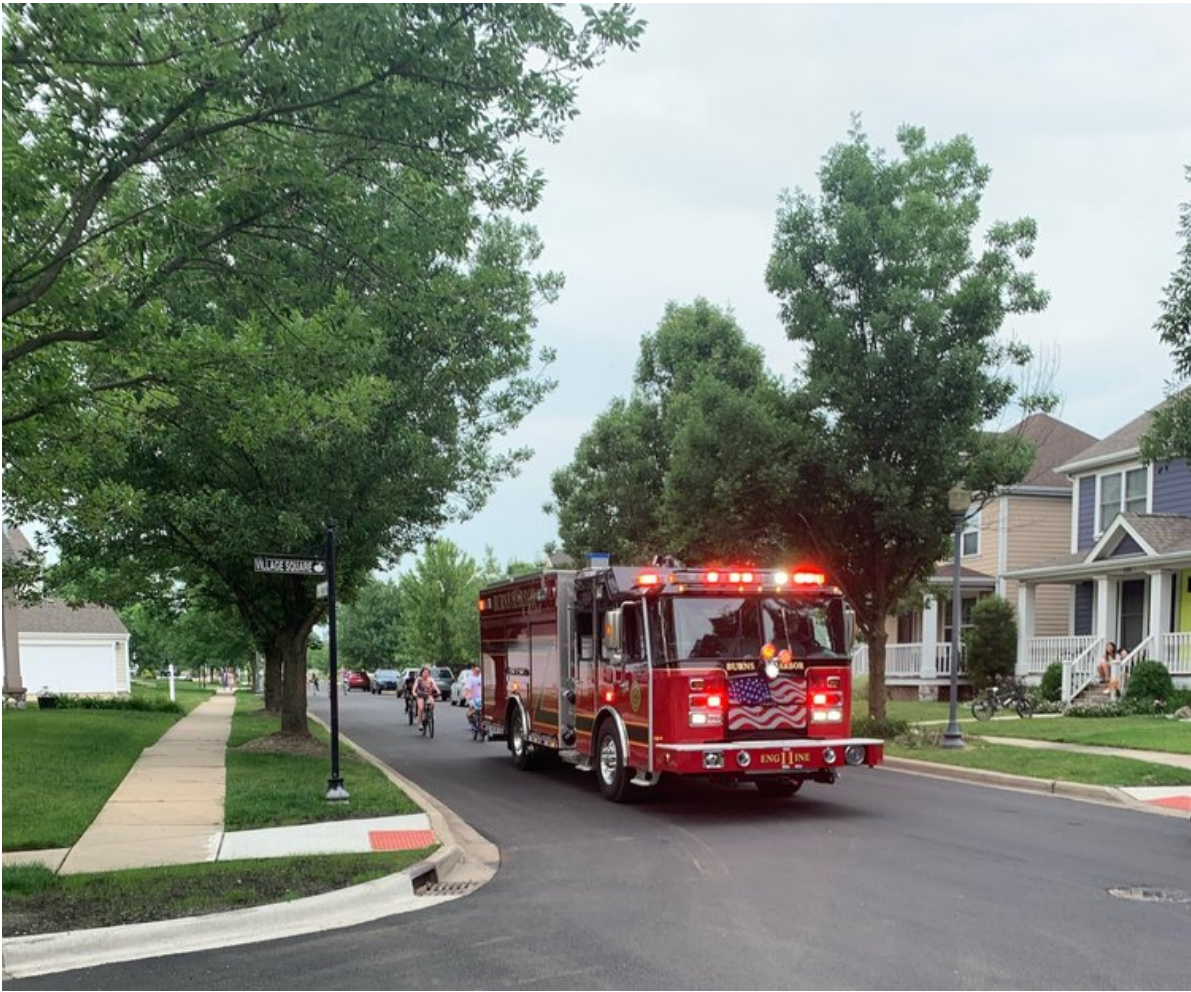
Burns Harbor Fire Truck