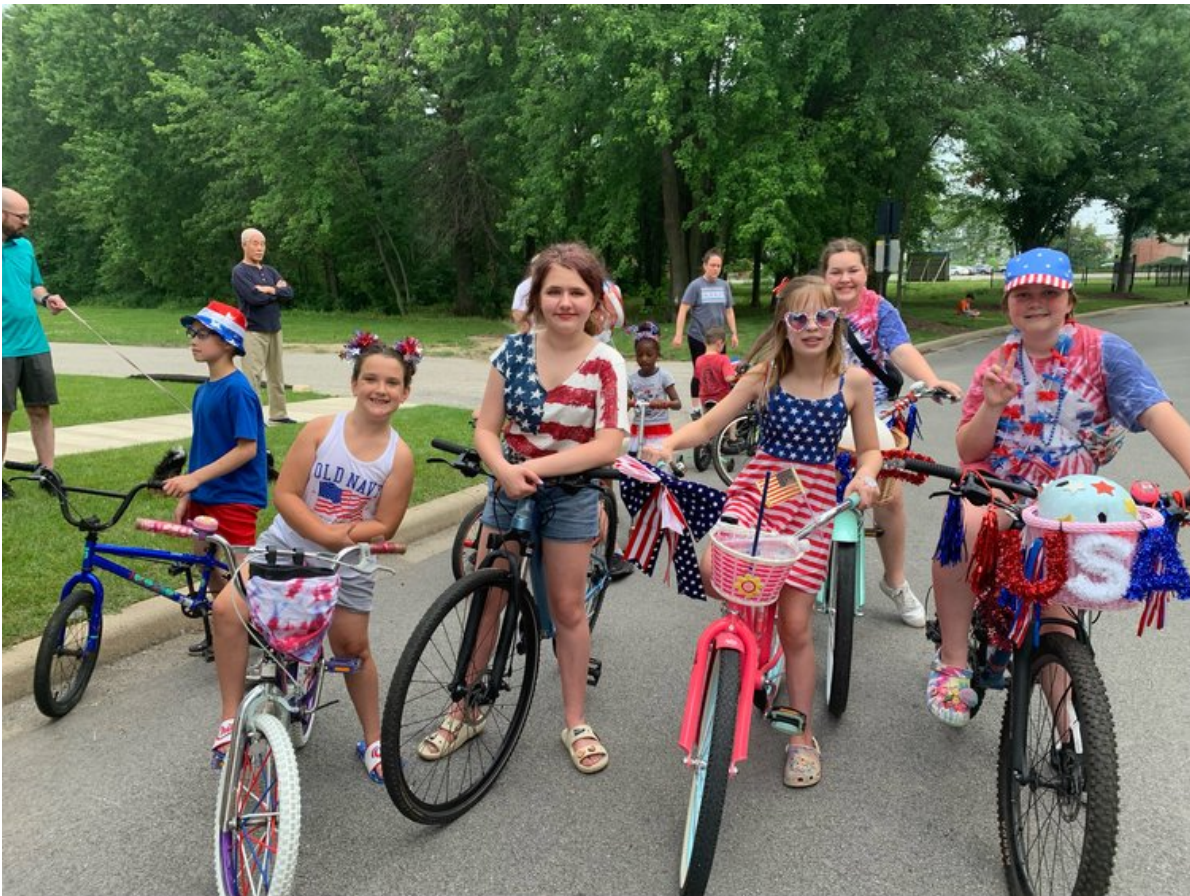
4th of July Parade & Picnic 2023

The Village in Burns Harbor NEWSLETTER 7/6/2023