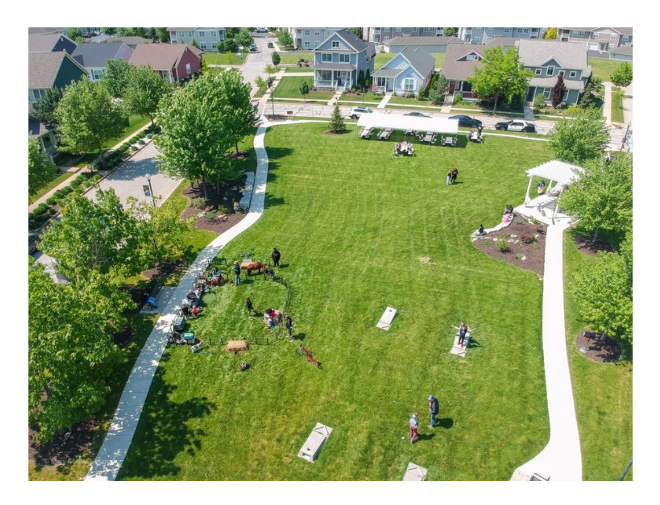
Aerial drone shot