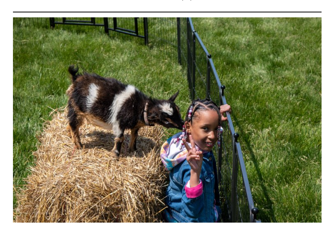
Spring Fling Mischievous goat

The Village in Burns Harbor NEWSLETTER6/3/2023