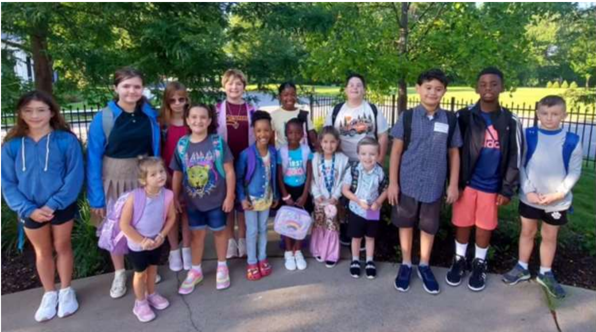
Gazebo bus stop picture before the 1st day of the school

The Village in Burns Harbor NEWSLETTER 9/8/2023