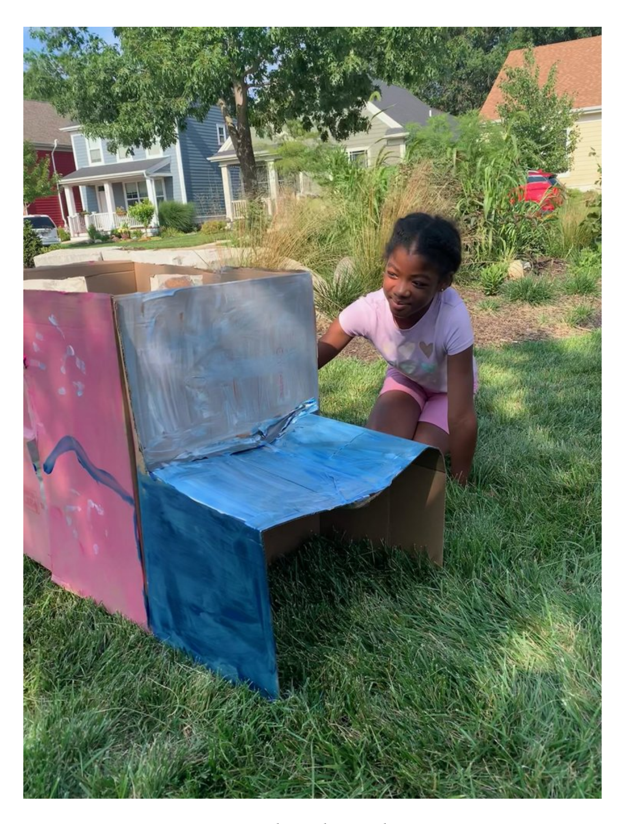
Adding the Finishing Touches