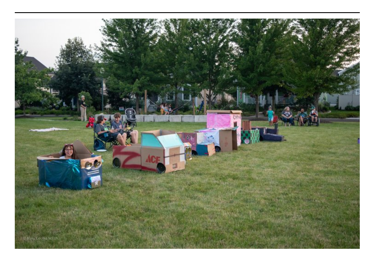
Drive-In Movie Night Cardboard Box Lineup 2023

The Village in Burns Harbor NEWSLETTER8/3/2023