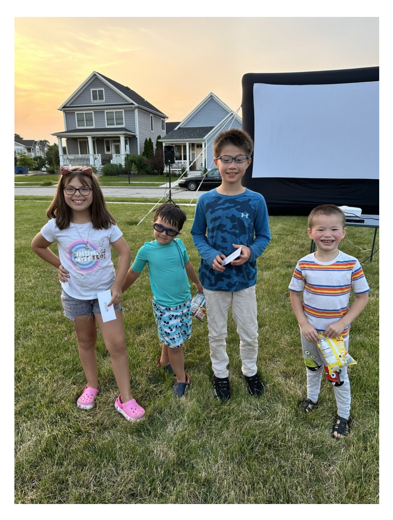
2023 Cardboard Box Car Decorating Contest Winners