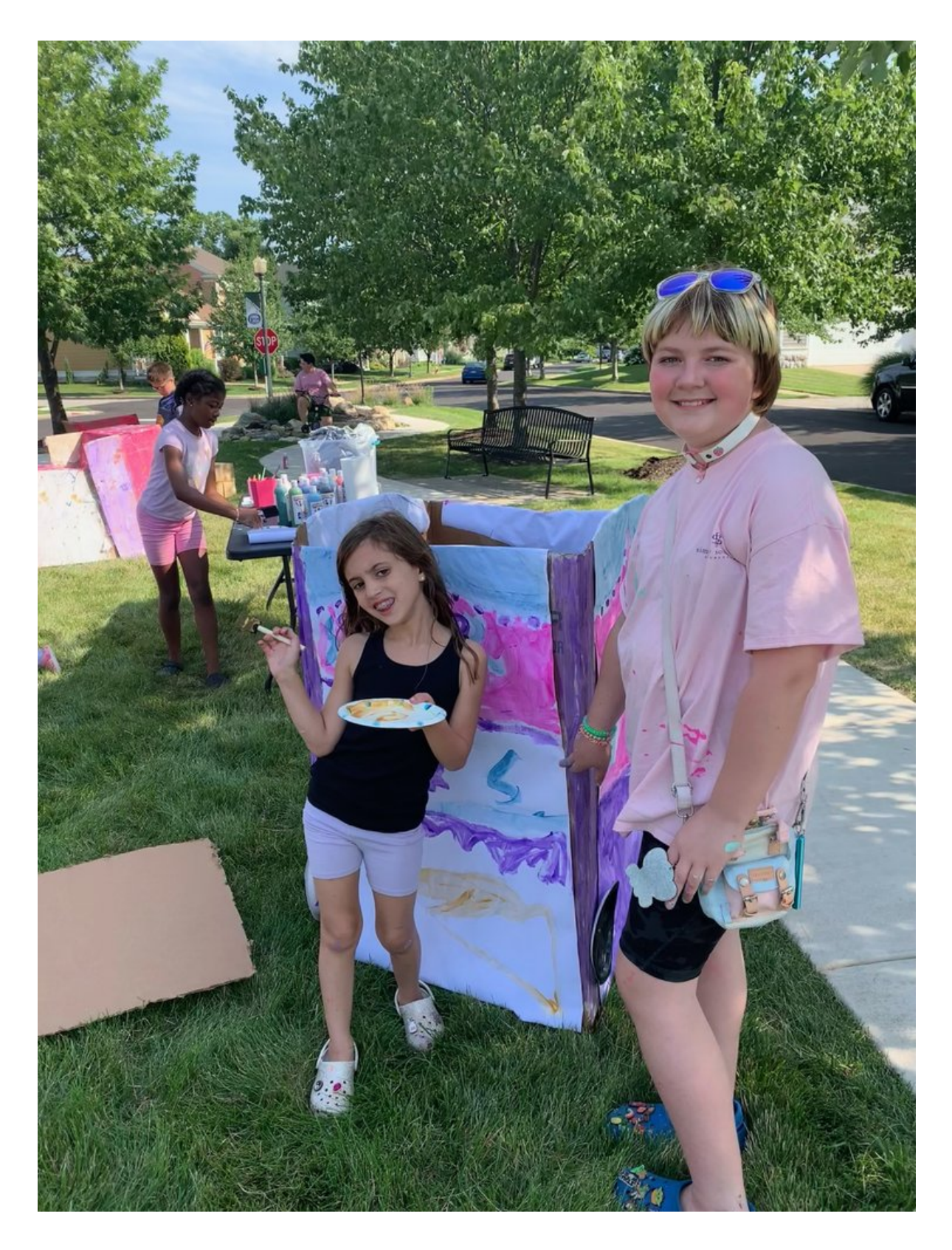
Cardboard Box Car Painting